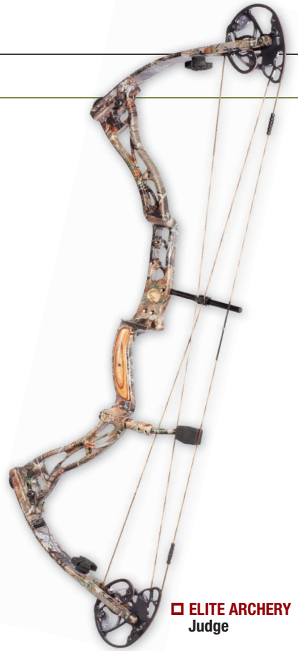
ELITE ARCHERY Judge

For more info on the all-new Elite Limited Lifetime Warranty, visit www.elitearchery.com or call (877) 503-5483.